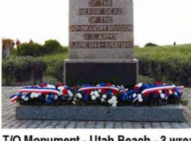
T/O Monument - Utah Beach - 3 wreaths laid in Memory on 70th Anniversary